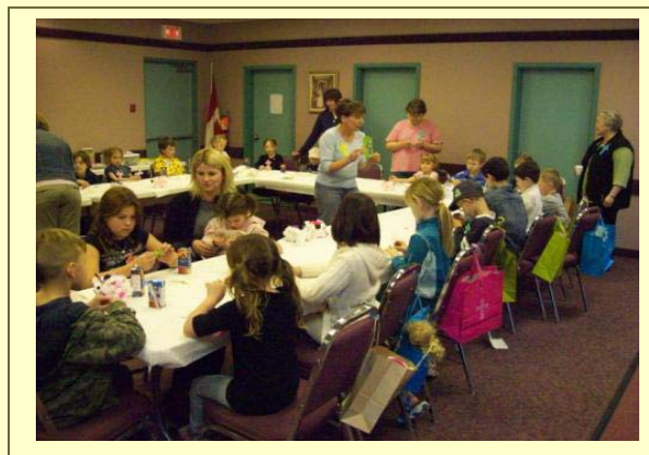
Easter For Kids at Morning Star

increased attendance, a worthwhile outreach and another blessing both to us and to those who attended.