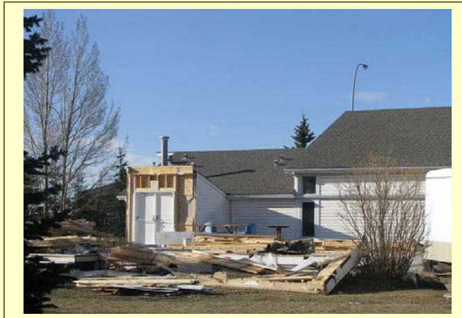
The removal of the trailers at St. Paul

As we pondered our Savior's death and resurrection once more, St. Paul's was blessed to have our largest Easter attendance in recent memory, with barely an empty seat. May the risen Lord move us to continue to work for him, knowing that our labor is not in vain!